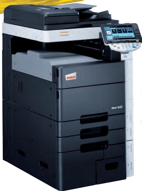
ineo+ 652 with output tray (OT-503)