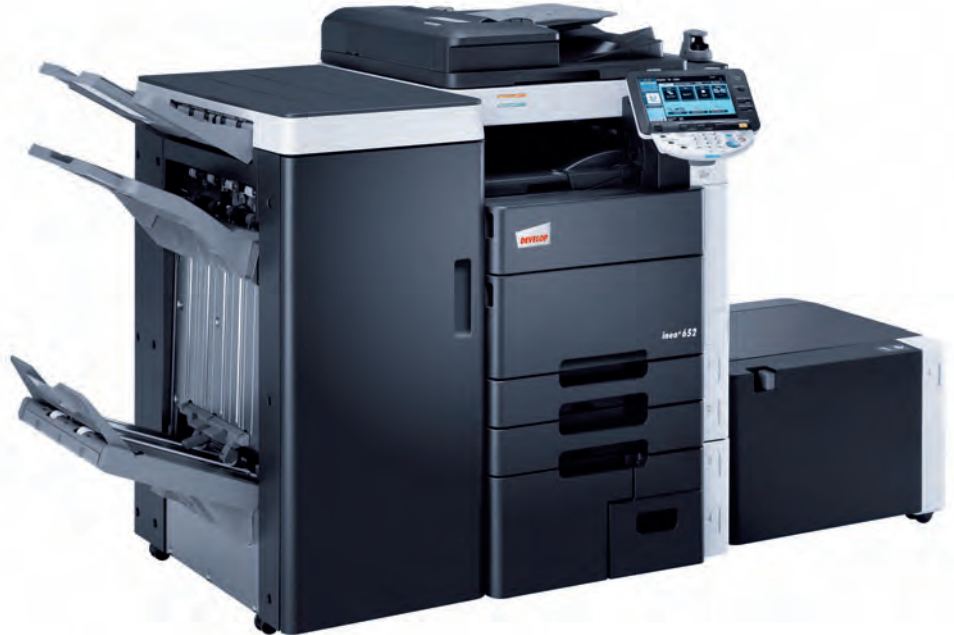
ineo+ 652 with staple finisher (FS-526), saddle kit (SD-508), working table (WT-506), biometric authentication (AU-102) and large capacity tray (LU-204)